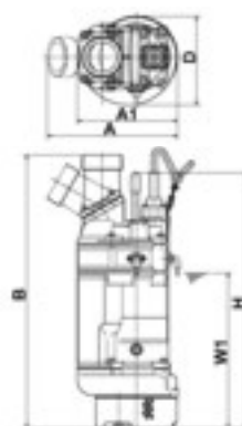
W1: lowest running water level

In the event of abrasive and corrosive utilization, stronger wear and tear will take place naturally in certain components. In this regard, please pay attention to our website www.tsurumi.eu/english/applications.htm .